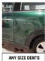
ANY SIZE DENTS