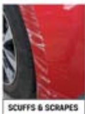
SCUFFS & SCRAPES