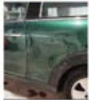
ANY SIZE DENTS