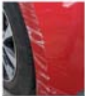
SCUFFS & SCRAPES