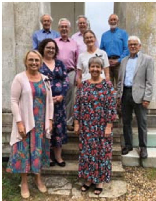
audience have been coming for years.” For event details see What's On, page 7.